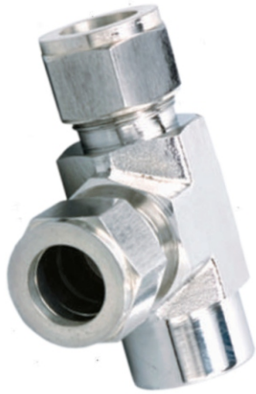
Dimensional Details :